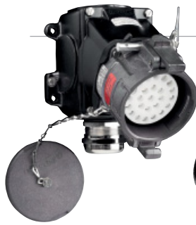
WALL MOUNTING SOCKET DXN25c